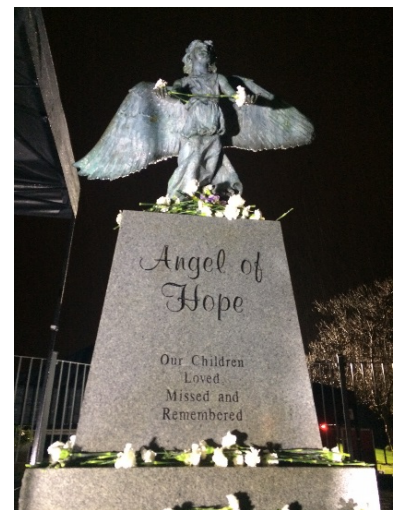
El Toro’s Angel of Hope Statue, adorned with flowers from the 2018 service

The service includes special music, poetic readings, and a special speaker. The program always ends with a touching and personal time when families are invited to come forward, speak their child’s name, and place white flowers of remembrance at the monument.