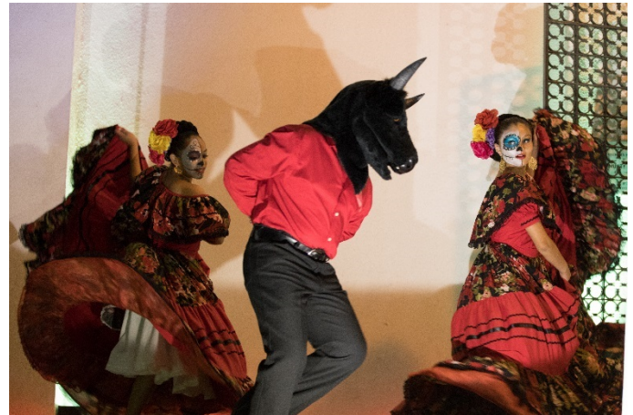
Dancers from Ballet Folklorico Donaji entertain the audience with traditional dances at Anaheim Cemetery's 2018 celebration.