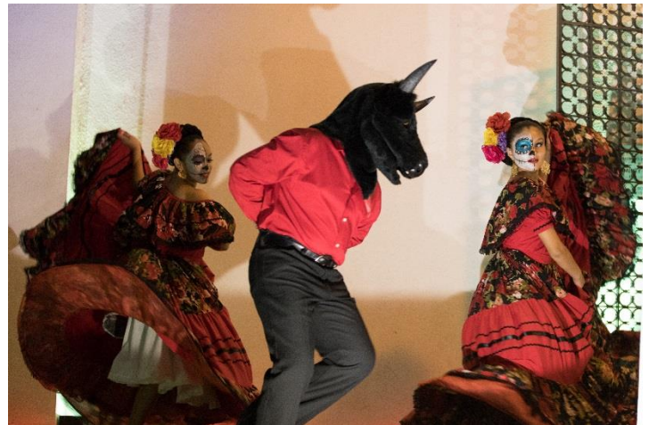
Performers with Ballet Folklorico Donaji entertain the audience with traditional dances.

Since marigolds are an important decoration for Dia de los Muertos, the District gave out 150 free, small bouquets with baby's breath until supplies ran out. Creativity was on display at the children's craft table, which was busy all night, offering an assortment of free crafts. Mila Berumen with Eternity Memorials volunteered to provide free face painting for children. Guests were also treated to free coffee, desserts, hot cocoa, and Pan de Muerto prepared by La Ideal Bakery until supplies ran out. Our thanks to Jody Daily for providing the beautiful Dia de los Muertos artwork from the Anaheim Parade which graced the mausoleum, and to Jeannette Payne for lending us her life size figures from the movie, "Coco" which was a huge hit for children attending the event. We can't wait to do it again next year!