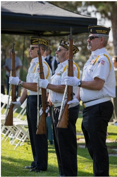
The VFW Edward J. Kearns Post 6024 Honor Guard