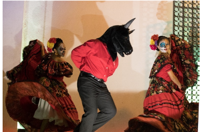
The talented dancers of Ballet Folklorico Donaji will once again perform at Anaheim Cemetery. The photo above was taken during last year's program.