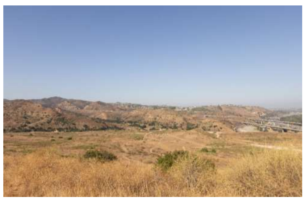
This beautiful location in Anaheim Hills, located at the intersection of the 241 Toll Road and CA-91 will be the future home of the Gypsum Canyon Memorial Park and the Southern California Veterans Cemetery.

The District is now moving forward on the next stage of the project which will include preparation of documents for the first phase of the public cemetery. We will also be continuing our collaboration with CalVet on the State Veterans Cemeterv Development. The Environmental Team will be coordinating with resource and regulatory agencies, such as the Army Corps of Engineers, Regional Water Quality Control Board, California Department of Fish & Wildlife, etc. in regards to permitting packages.